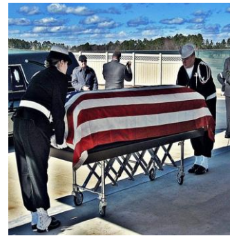
My Dad's final resting place at Jax Memorial Cemetery