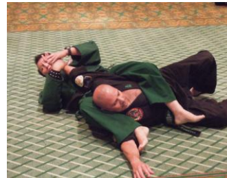
Rolling Crucifix Arm break shown midway and completed