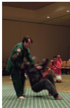
Iron Wing Take Down completed