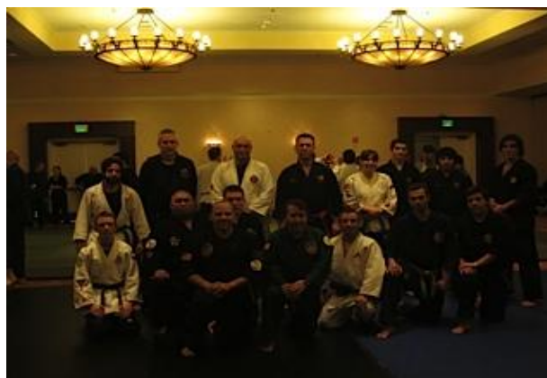
Students pose for picture after seminar