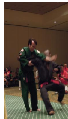
Iron wing take-down