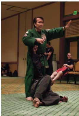
Posing before wrapping In for technique