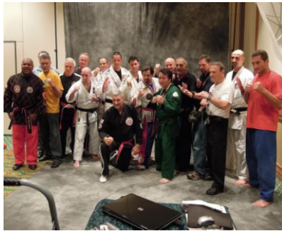
Instructors line-up for photo shoot