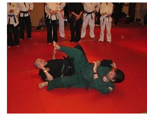
Class practices Latte Stone Form Beginning of Rolling Snake Strike to face ending on ground preparing to deliver heel strike to groin w/ knee break