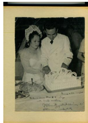
My Dad's Wedding photo in Navy uniform & signed by his "Boss", Admiral Nimitz