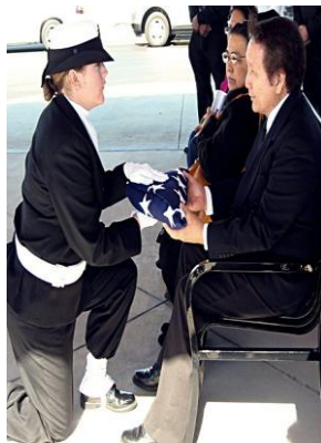
My Dad would have been proud of the military honors given to him, I know I was.....