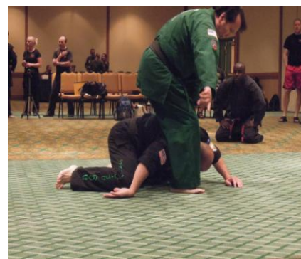
Beginning of Rolling Crucifix Arm break